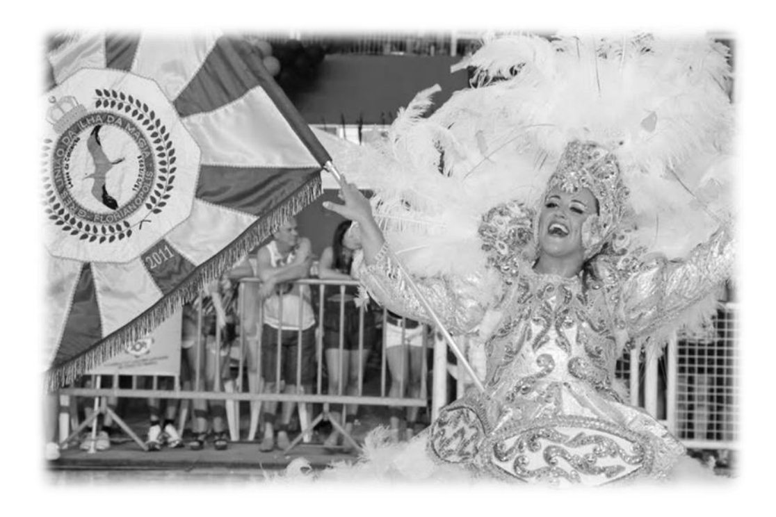
Figure 6 – The flag holder and the official organization flag, 2011 parade