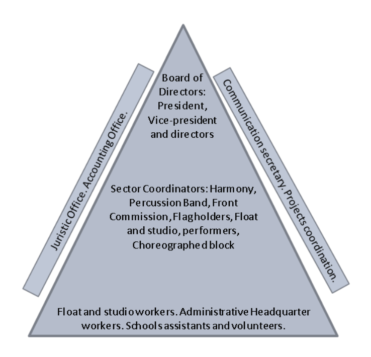
Figure 3 – Formal Structure of União da Ilha da Magia