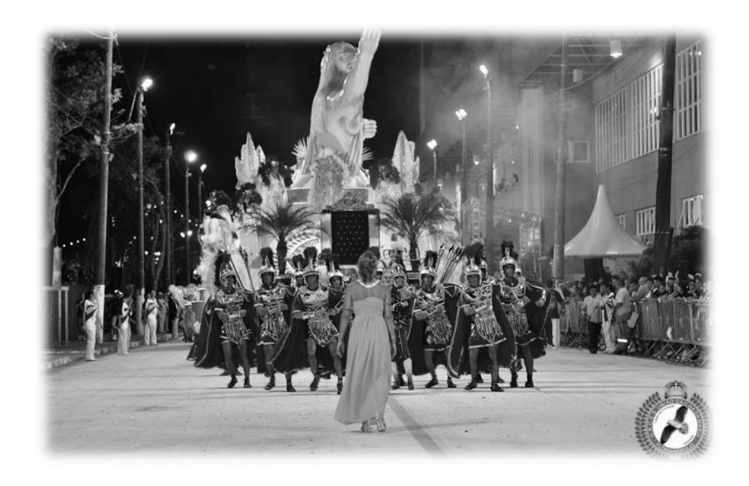
Figure 8 – Front commission's choreographer and dancers, 2012