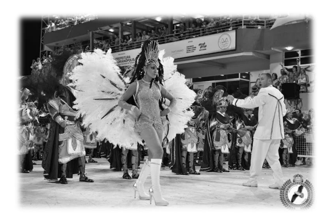
Figure 7 – The master of percussion band and the queen of the