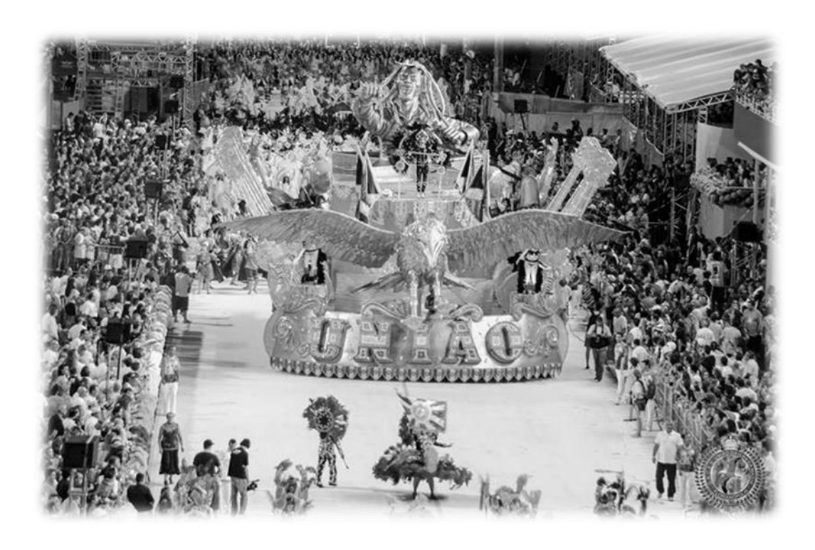
Figure 5 – União da Ilha da Magia, 2012 parade