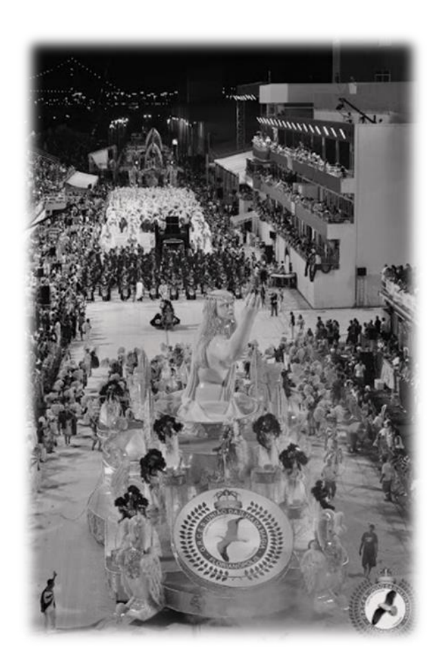
Figure 4 – União da Ilha da Magia, 2012 parade